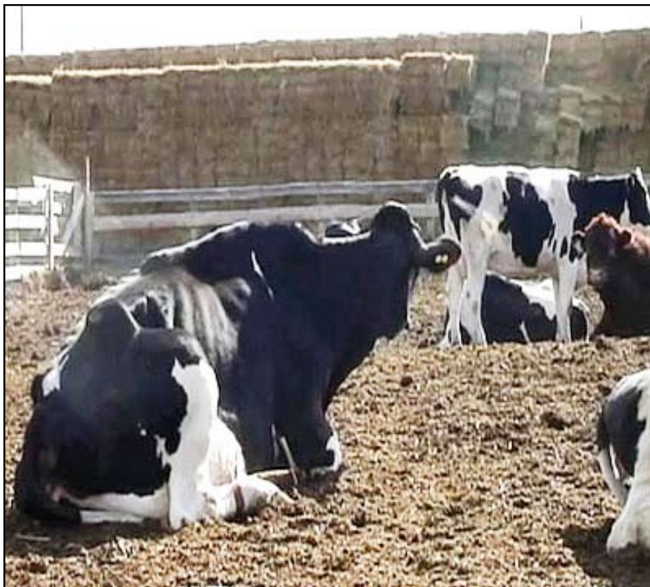
Ailing Cow at Winnipeg Livestock Auction

It was a sad but likely fact that the only human kindness that that this cow experienced was by the veterinarian who provided her with her final human contact, releasing her from her agony by euthanizing her.